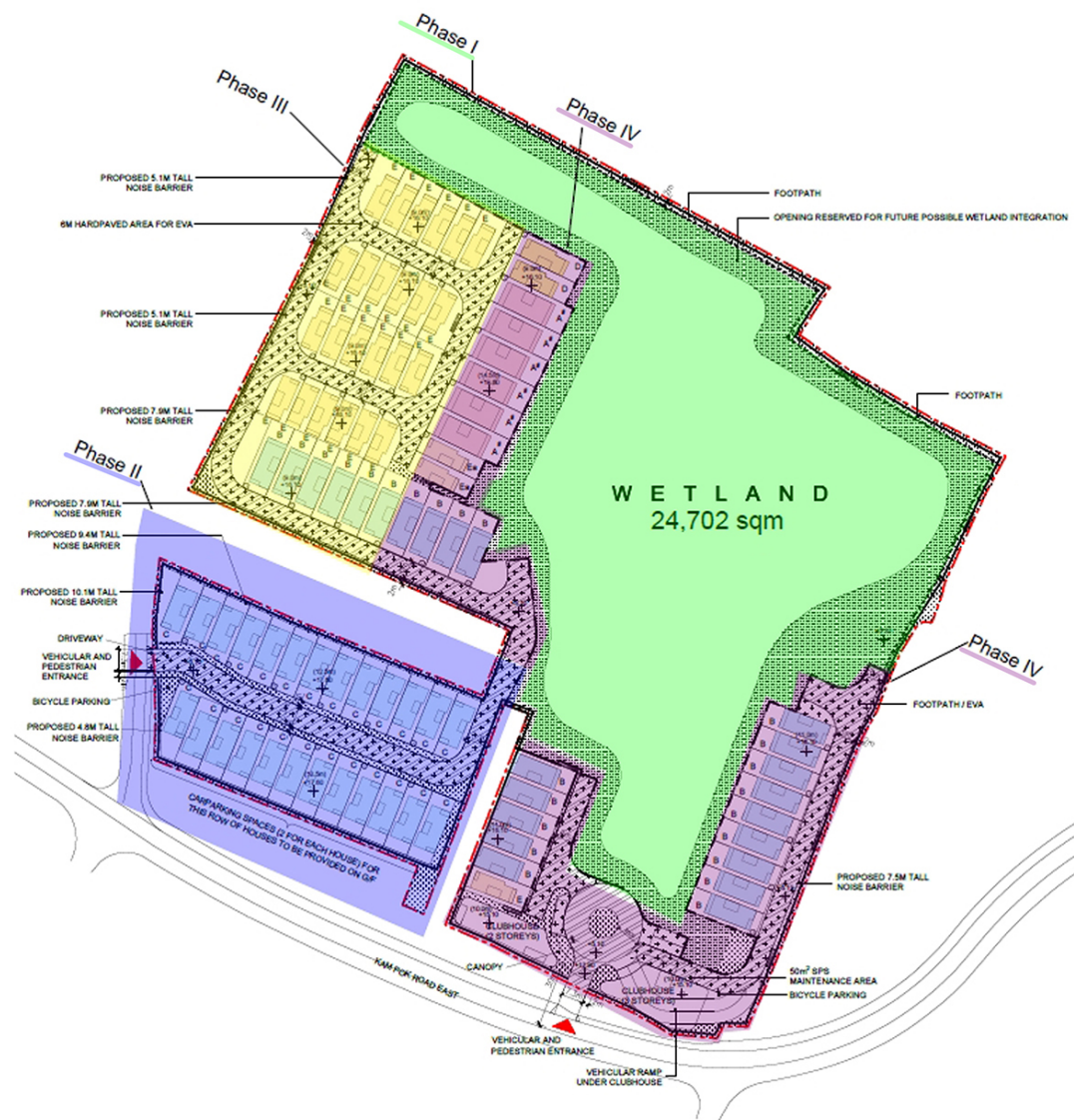
Figure 5.1 Different phases of the construction