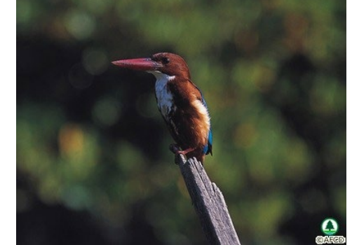
White-throated Kingfisher Halcyon smyrnensis